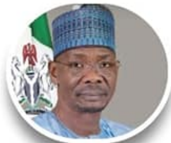
ENGR. ABDULLAHI A. SULE Executive Governor, Nasarawa State