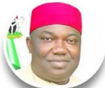
RT. HON. I. UGWUANYI Executive Governor, Enugu State