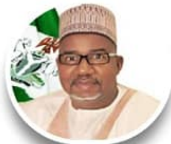
SEN. BALA MOHAMMED Executive Governor, Bauchi State

Visit www.ncs.org.ng/nitma-2021 to Vote | General Pulic |